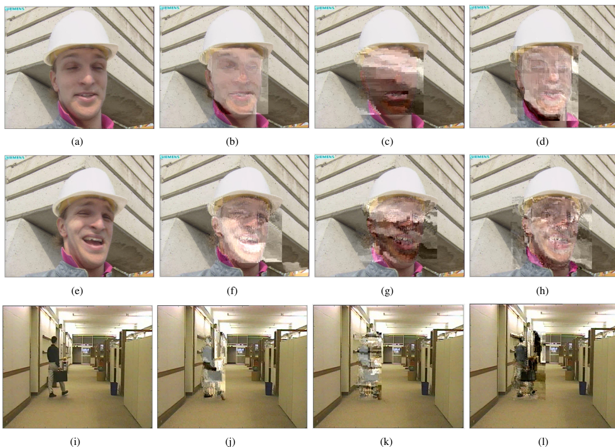
Fig. 2: With CIF size, QP= 24 and IP = 5: (a) The 1st frame of original 'foreman' (I frame), (b) encrypted by SNC, (c) encrypted by SNC+IPM, (d) encrypted by our process. (e) The 15th frame of original 'foreman' (P frame), (f) encrypted by SNC, (g) encrypted by SNC+IPM, (h) encrypted by our process. (i) The 40th frame of original 'hall' (P frame), (j) encrypted by SNC, (k) encrypted by SNC+IPM, (l) encrypted by our process.

We are evaluating the security of our process in terms of brute force and replacement attacks and we are refining the method to be robust against these attacks.