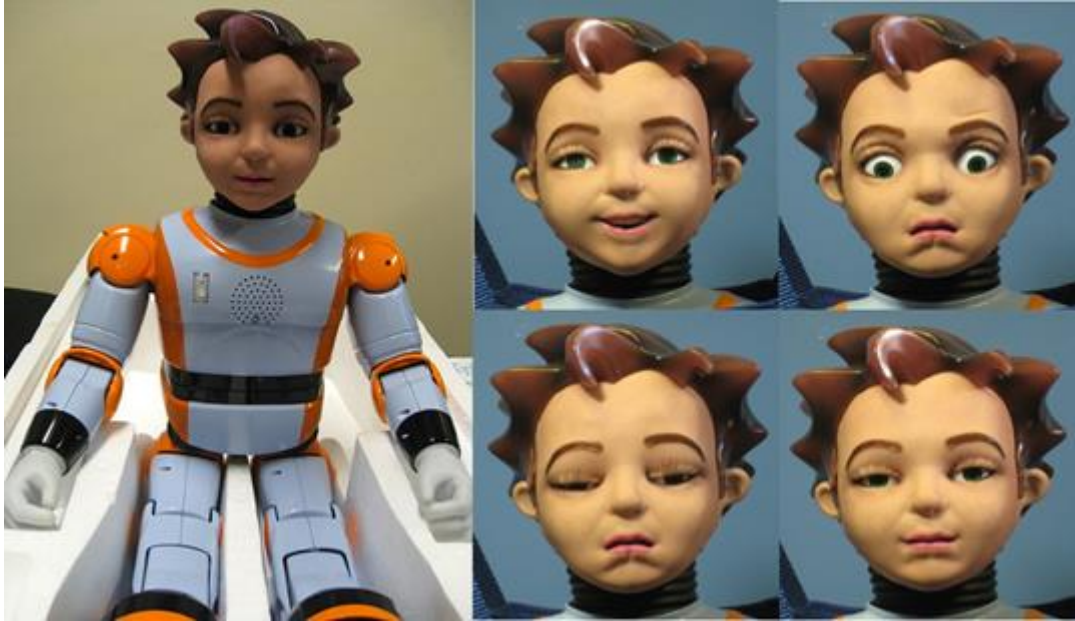
Figure 1. The Hanson Robokind Zeno R50 robot with example facial expressions

Zeno R50 (Hanson et al., 2009) which has a realistic silicon rubber (“frubber”) face, because this can be reconfigured, by multiple concealed motors, to display a range of reasonably life-like facial expressions in real-time (Figure 1).