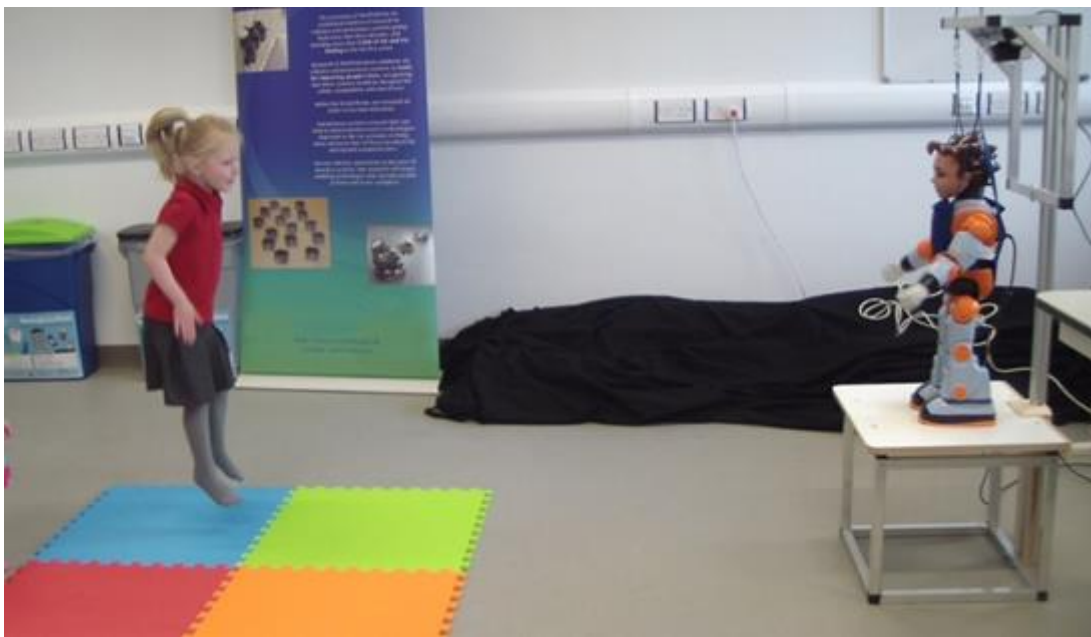
Figure 2. A child playing Simon Says with Zeno

Zeno gave one of three simple action instructions: “ Wave your hands ”, “ Put your hands up ” or “ Jump up and down ”. Each instruction was given either with the prefix of “ Simon says ” or no prefix; instructions were delivered in pseudorandom order. Zeno gave relevant actions to accompany each instruction (e.g., waving its arms with the “ Wave your hands ” instruction). Each instruction delivered was accompanied with Zeno moving its mouth to correspond to the synthesised speech.