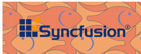
Incorrect use on a patterned background