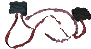
Fig. 3. The point cloud segmented using the PointRend (PR) Object Segment Semantics (OSS) training configuration can be converted to an object mesh for object grasping and manipulation applications.

still confounds wire point cloud segmentation. This work leaves three questions unanswered for future work: